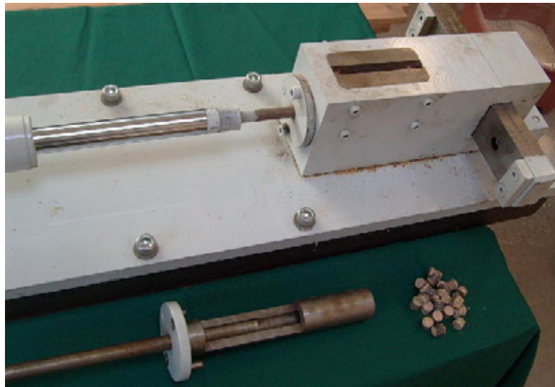
Figure 1: The pellet test rig. The piston used in these trials had a diameter of 12mm.

A suitable small scale pellet mill/test rig was constructed to this specification by Dragon Machinery (Dragon Works, New Inn, Pencader, Carmarthenshire SA39 9AY)