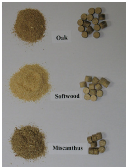
Figure 3: Various sawdusts and resulting pellets